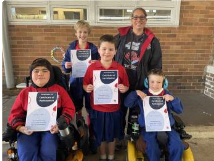
Winner of Bocce