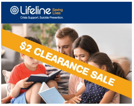
SAT 28 TO SUN 29 MAY 8am-4pm Hornsby War Memorial Hall 2 High Street, Hornsby